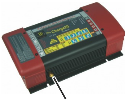
Earth bonding point

Pay close attention to earthing of equipment. Equipment is often installed without adequate earth bonding. Please consult the equipment's installation manual, or contact the manufacturers for more information.